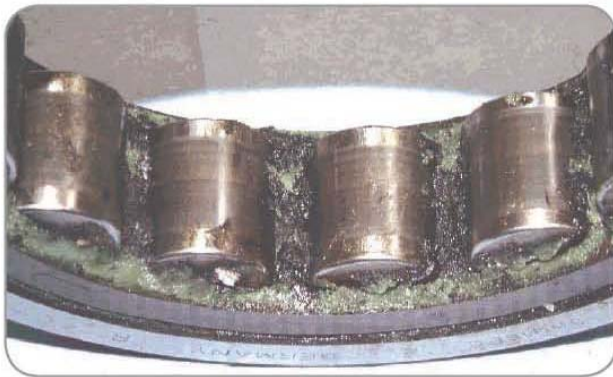
Lubricant degradation caused by electrical discharge currents